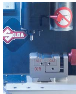
Optimized cutting station for laser and dimple keys

Keep the entire Silca database and key cutting expertise at hand. Futura One's compact dimensions, reduced weight and ergonomic grip below the machine body make it easy to carry and suitable for small-sized shops. The see-through safety shield slides within the machine body to reduce encumbrance to the minimum.