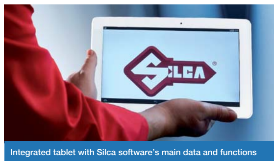
Integrated tablet with Silca software's main data and functions

The 10" touch-screen tablet integrates Silca Key Programs software's main data and functions, allowing you to search through the